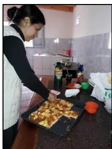
Making Pizza and having lunch in the new Kitchen/Dining Room