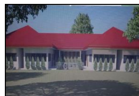
Rendition of the new Center

Christian Mission in the Far East, Philippines , is building a new Center for their office space.