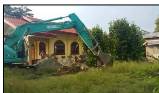
Digging for the Center